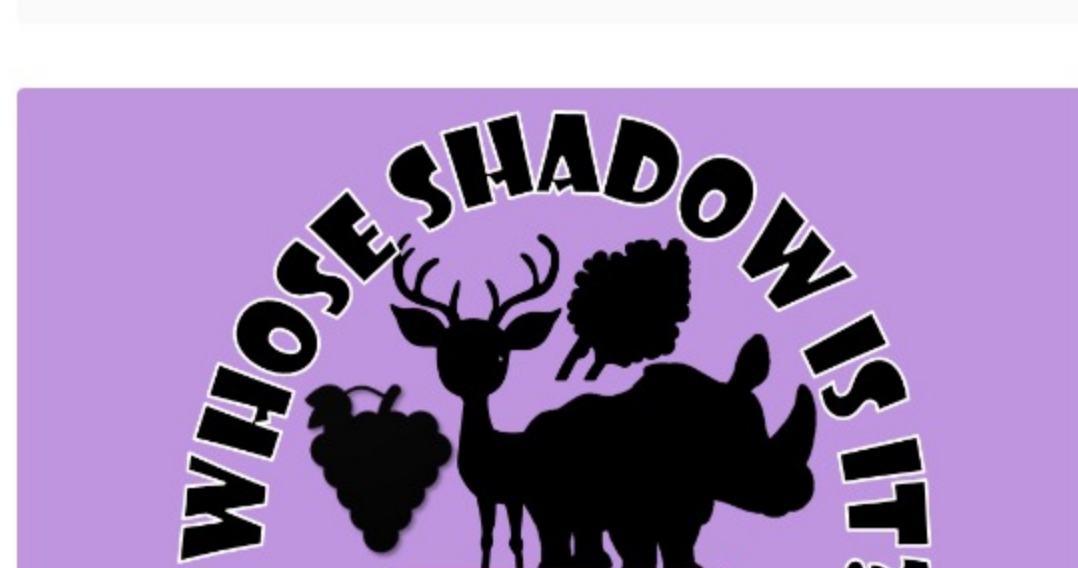
TEMPLATE 6: WHOSE SHADOW IS IT?