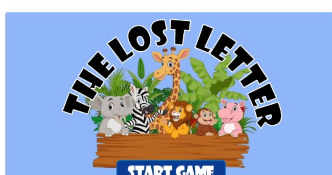
TEMPLATE 4: THE LOST LETTER