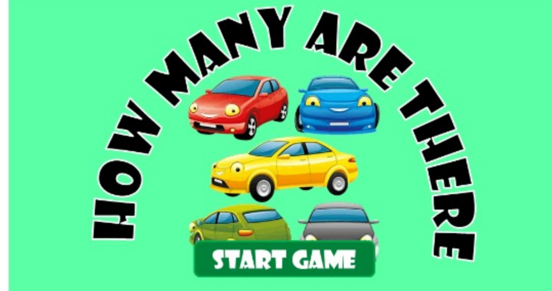
TEMPLATE 2: HOW MANY ARE THERE?