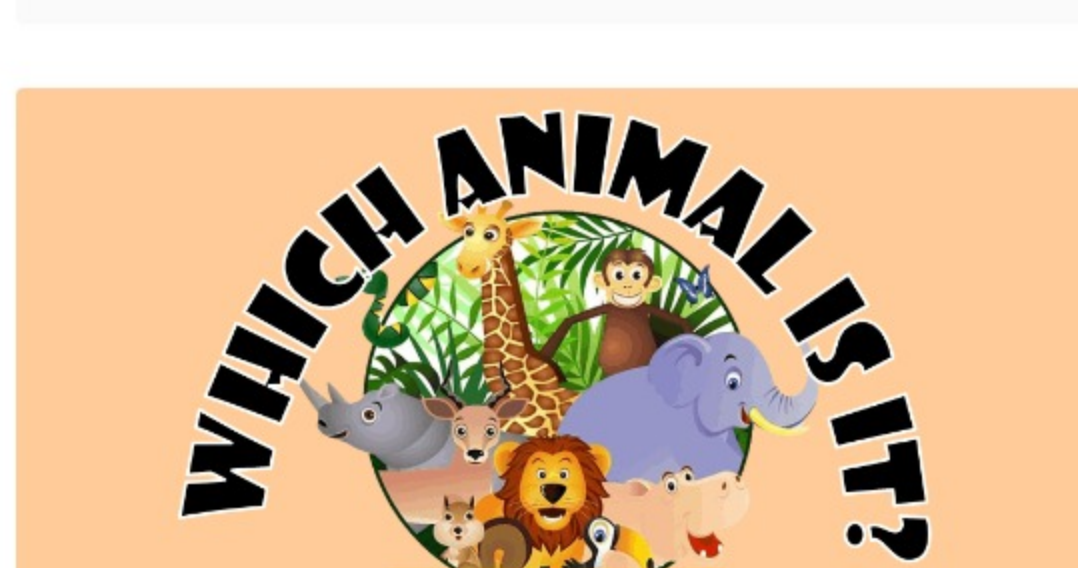
TEMPLATE 5: WHICH ANIMAL IS IT?