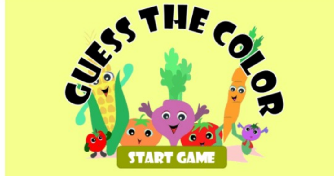
TEMPLATE 1: GUESS THE COLOR

Bored at home? Turn your living room into a playground with our interactive kids Games presentation templates! Whether it's for a family game night, a virtual gathering with friends, or a fun-filled classroom activity, those templates have everything you need to keep the excitement alive.