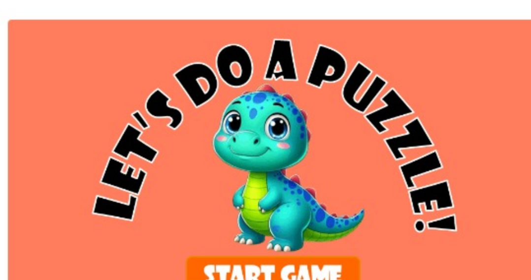
TEMPLATE 3: LET'S DO A PUZZLE!